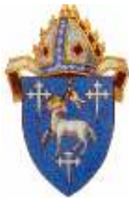
Diocese of North Queensland