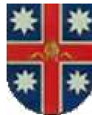
Anglican Church of Australia