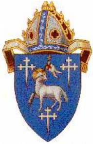
Diocese of North Queensland